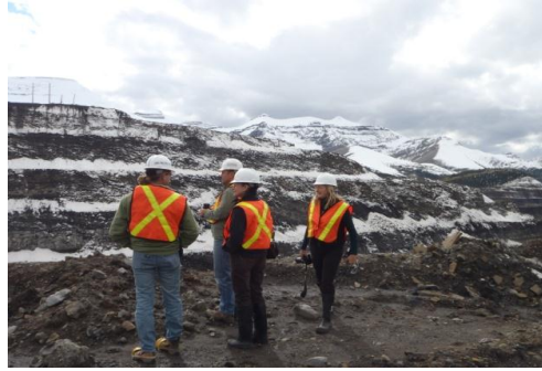
AWC-WPAC Board of Directors on tour of Cheviot Mine, Teck Resources Ltd. – September 2010