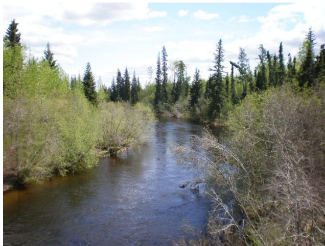
Jackfish River - lower Athabasca Watershed in spring

Nominations Committee: The purpose of the Nominations Committee is to ensure all fifteen board positions are filled with the best possible candidates; selected in an open, fair and transparent manner.