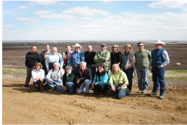
AWC-WPAC Board of Directors on tour of reclamation of Tailings Pond 1 Suncor Energy Inc., Fort McMurray, AB – May 28, 2010